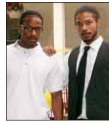
Housing Programs pg 3