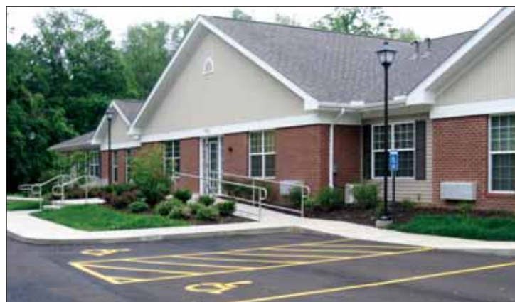
Robin's Terrace located in Millersburg

OMCDC also became a general partner in a program in Columbus, Ohio with over 200 units. Today, CHC and OMCDC offer over 350 units of affordable housing for those people in need around the