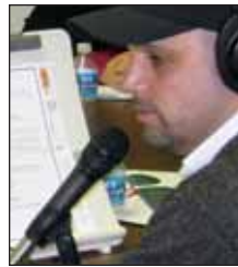
The Summit at CHC pg 2

The Quarterly Newsletter of the Community Health Center, Inc. and the Community Health Center Foundation, Inc.