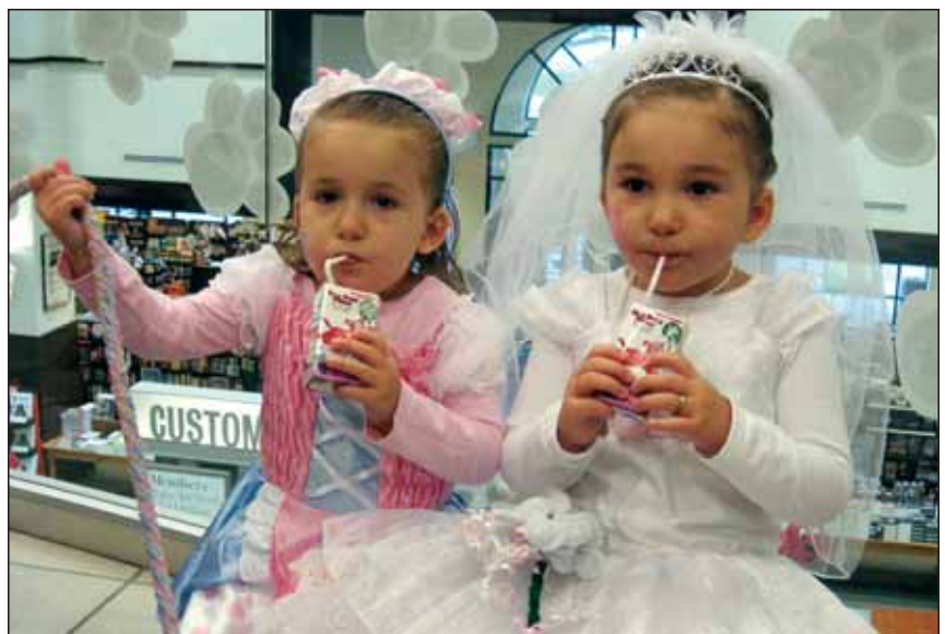
The Mile of Quarters is our public fundraiser held annually at Barnes & Noble Booksellers in Bath. Hundreds of children enjoyed story readings and free activities in the store as well as organic juice boxes courtesy of Hansen Beverage Company.

Established in 2002, Project Hope is funded by the U.S. Department of Housing and Urban Development through the Summit County Continuum of Care. Since its inception, the program has celebrated 22 graduates.